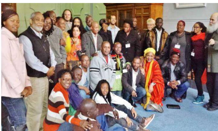
1 July: African Nonviolence and Peacebuilding Network meeting.

Since its establishment in 2012 and reorganisation in June 2014 Pan African Network on Nonviolence and Peacebuilding (PANPEN) has connected African grassroots civil resisters and nonviolent activists, and empowered them to take actions to transform violence, promote peace, democracy and nonviolent alternatives to conflicts. The network comprises over 50 organisations, representing over 30 countries in the region and enjoys rich diversity of members from youth and women groups and organizations to civil society, academia and professional institutions, faith based groups working with a strong focus on using nonviolence as a peacebuilding technique. The network is being managed voluntarily by a 20-member Steering Committee representing West, East, Central