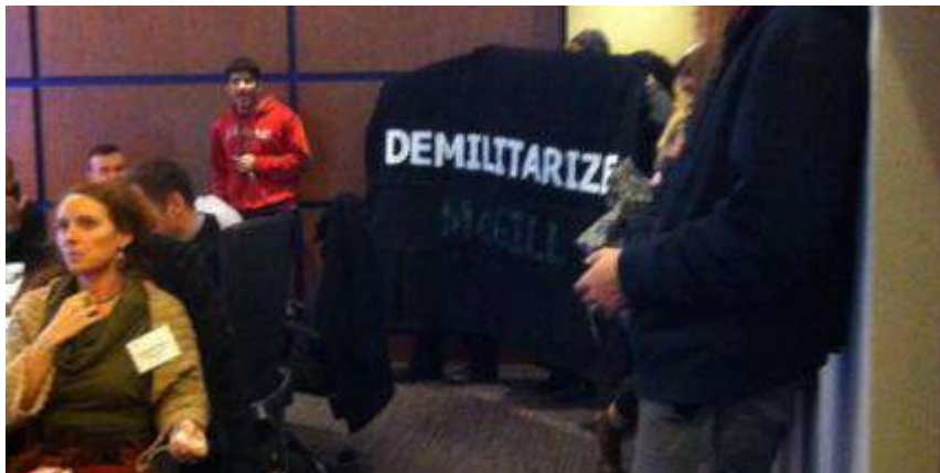
Demilitarize McGill disrupting military space conference as part of the week of action

The first ever international week of action for military-free education and research was held between 25-31 October 2014. This follows on from a day of action the previous year. Anti-militarists across the world took action to raise awareness and challenge the role the military has in education and research in educational institutions which gives the Armed Forces access to young people, enabling them to lay the groundwork for recruitment later in life and to promote military values.