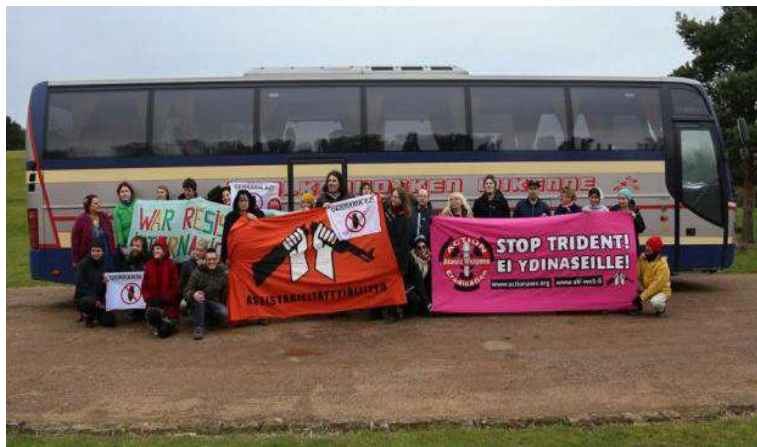
European Antimilitarist Network members meeting before Burghfield Lockdown

We also agreed to produce a joint video, which would showcase the activities of the different member groups. This should be ready later in 2015.