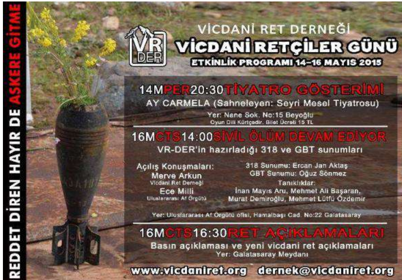
15 May events in Turkey

Prisoners for Peace Day is on 1st December and International Conscientious Objection Day on 15th May. Our role in this is to encourage groups to use these days – to hold events and actions – and to spread the word themselves. We publicise events around the world on our website ( here and here this year).