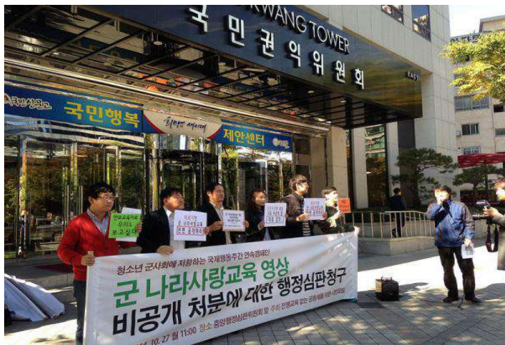
Street action in Seoul as part of the week of action

challenged military presence in schools through direct action, some publicly debated the presence of the military in education, others showed films, wrote articles, and campaigned on social media.