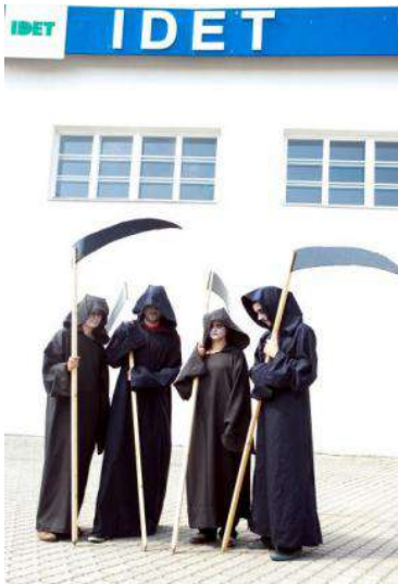
Action outside the IDET arms fair after European Network Against the Arms Trade meeting in Brno, Czech Republic

In March 2015, a new committee was established to support the work of the Nonviolence Programme worker in regards to war profiteering. The committee has a conference call roughly every six weeks to discuss the ongoing work and new project ideas, and is made up of WRI members from India, South Africa, Venezuela, the Netherlands, the UK, and South Korea.