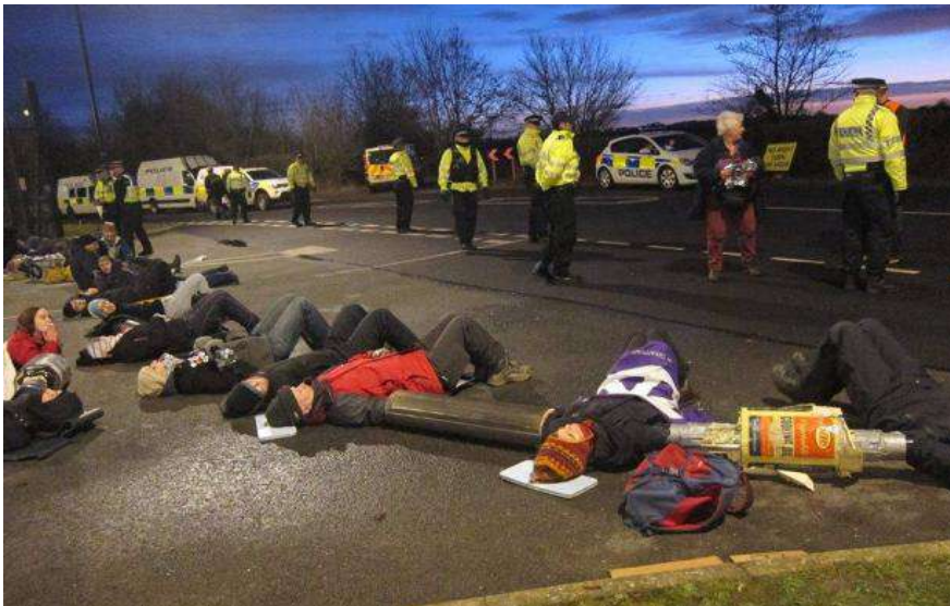
Construction gate at Burghfield Nuclear weapons factory blockaded

After the action, a meeting of the European Antimilitarist Network was held. The meeting was all the more productive and dynamic for the participants having shared the action beforehand. It built trust and energy!