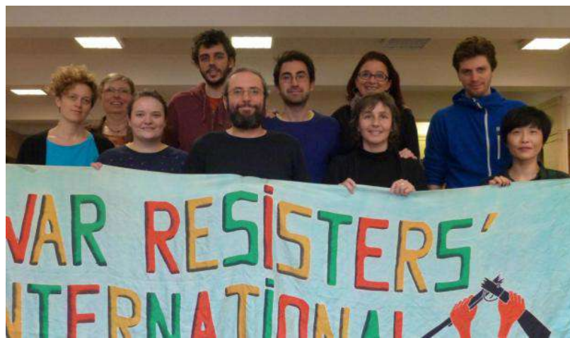
WRI Exec and staff meet in London in February

Executive – this has to be confirmed by the Council meeting in Seoul. As consequence, the Executive has been reduced by one member. It has discussed the need to find a new additional member. While it was felt that there was no extreme urgency and therefore the Exec did not move forward to identify and co-opt a new member, the Exec requests the Council to start a process to identify and elect an additional member, to be elected in Seoul or later either by e-mail or at the 2016 Council meeting. The Exec felt strongly that the person should come from either Latin America or from Africa for reasons of regional balance, and that a Council Listening Committee would be needed to assess and find the right candidate.