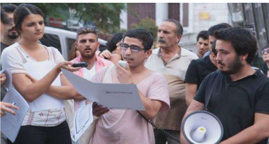
A CO publicly declaring his objection. 6 September 2015, Istanbul

another meeting, joint action days, or joint campaigns.